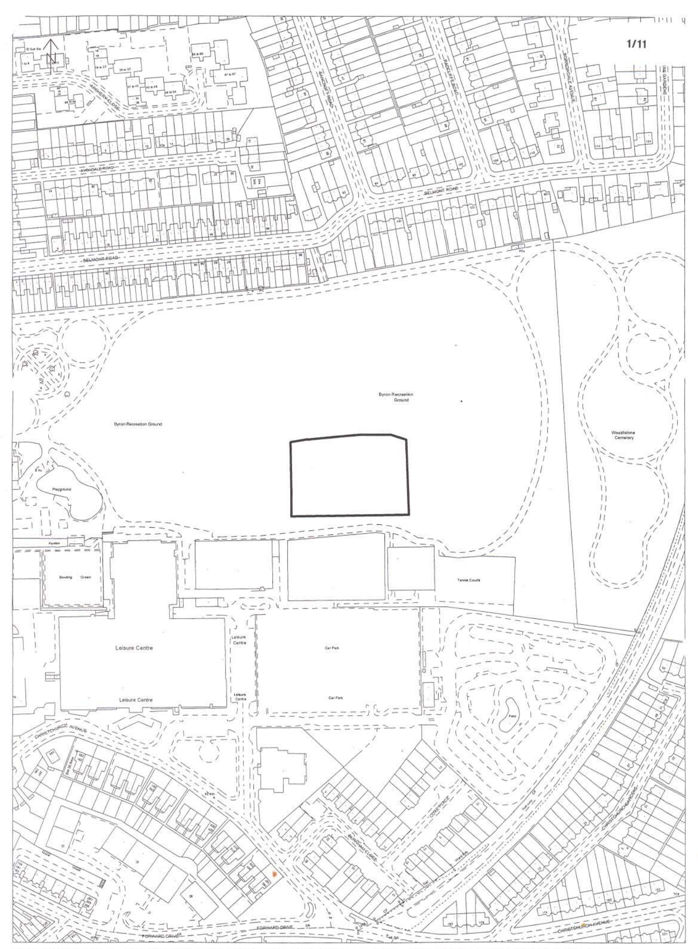
© Crown Copyright. Unauthorised reproduction infringes Crown copyright and may lead to prosecution or civil proceedings. Reproduced from the Ordnance Survey mapping with the permission of the Controller of Her Majesty's Stationery Office.